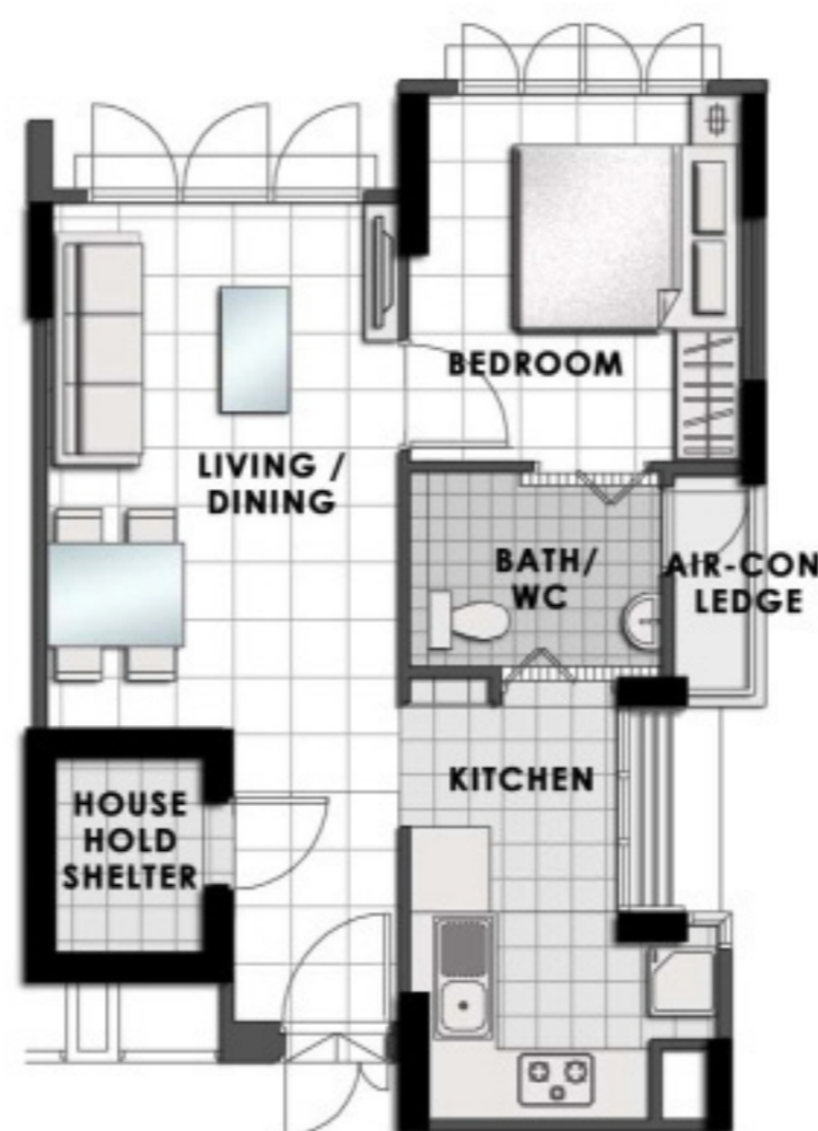
LAYOUT IDEAS FOR 2-ROOM APPROX. floor area 47 sqm (Inclusive of Internal Floor Area 45 sqm and Air-Con Ledge)