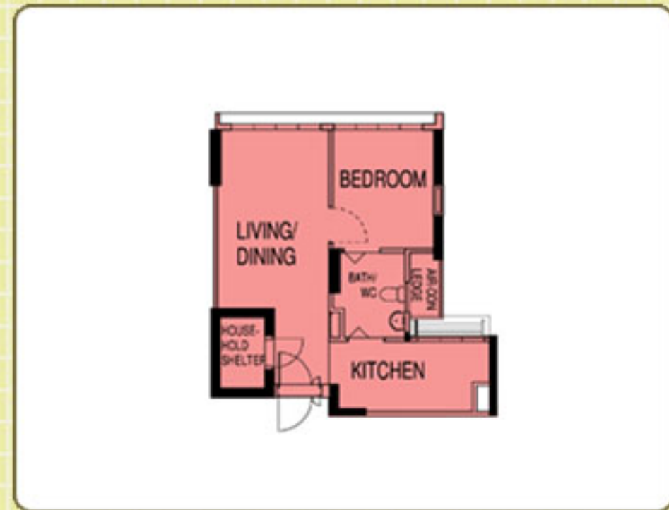
TYPICAL 2-ROOM (TYPE 2) FLOOR PLAN

(Inclusive of Internal Floor Area of approx 35 sqm and Air-Con Ledge)