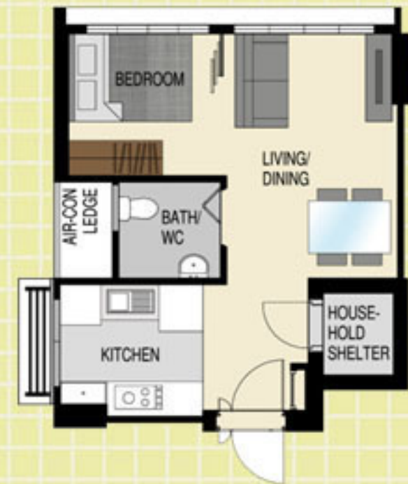
LAYOUT IDEAS FOR 2-ROOM (TYPE 1) APPROX. FLOOR AREA 37 sqm (Inclusive of Internal Floor Area of approx 35 sqm and Air-Con Ledge)