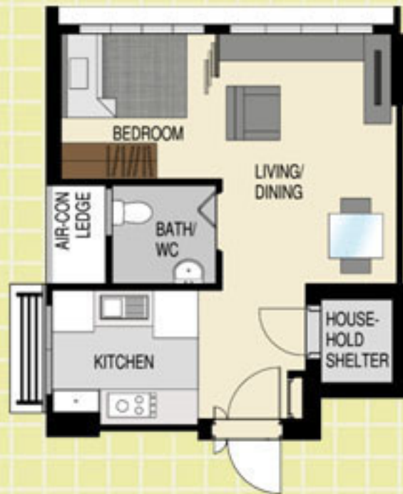
LAYOUT IDEAS FOR 2-ROOM (TYPE 1) APPROX. FLOOR AREA 37 sqm (Inclusive of Internal Floor Area of approx 35 sqm and Air-Con Ledge)