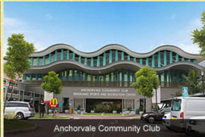
Anchorvale Community Club