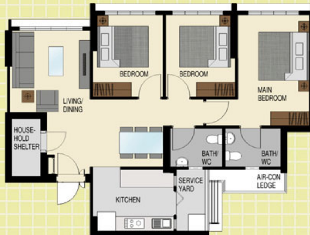
LAYOUT IDEAS FOR 4-ROOM

(Inclusive of Internal Floor Area 65 sqm and Air-Con Ledge)