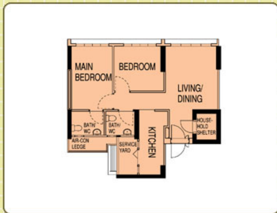
TYPICAL 3-ROOM FLOOR PLAN

(Inclusive of Internal Floor Area 45 sqm and Air-Con Ledge)