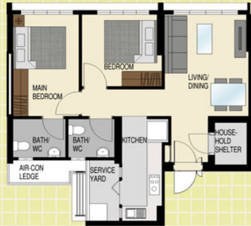
LAYOUT IDEAS FOR 3-ROOM

(Inclusive of Internal Floor Area 45 sqm and Air-Con Ledge)