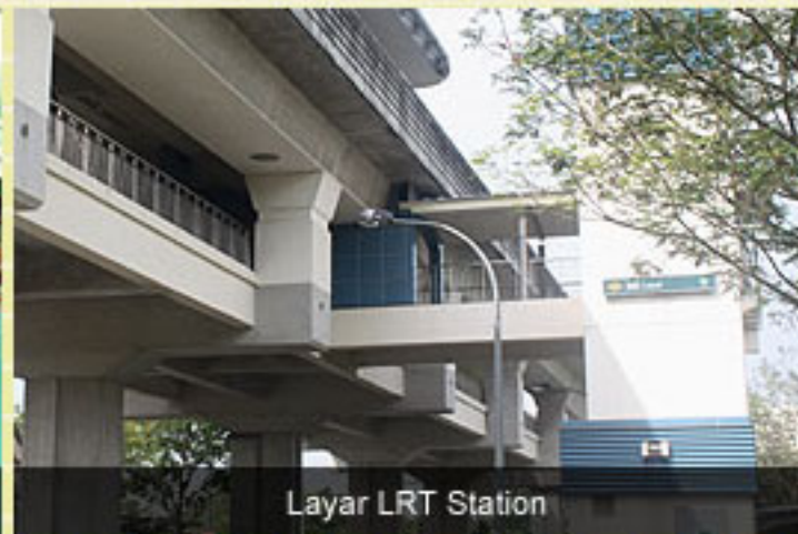
Layar LRT Station