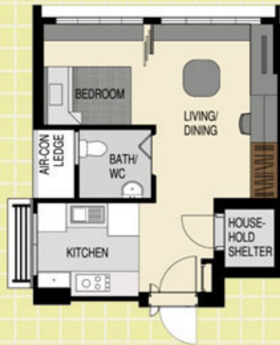
LAYOUT IDEAS FOR 2-ROOM (TYPE 1) APPROX. FLOOR AREA 37 sqm (Inclusive of Internal Floor Area of approx 35 sqm and Air-Con Ledge)