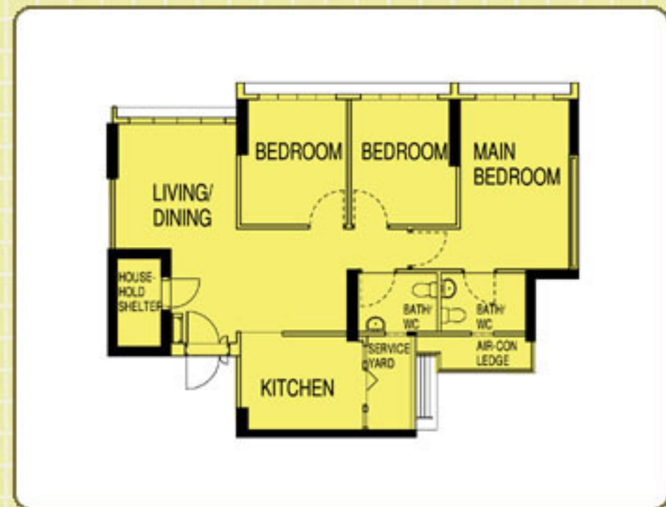
TYPICAL 4-ROOM FLOOR PLAN

(Inclusive of Internal Floor Area 65 sqm and Air-Con Ledge)