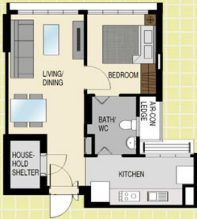
LAYOUT IDEAS FOR 2-ROOM (TYPE 2)