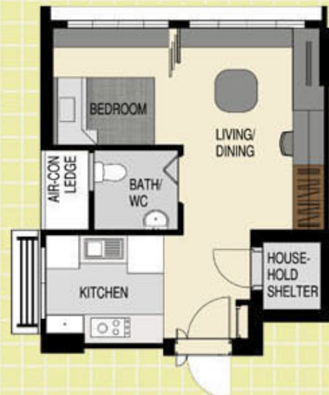
LAYOUT IDEAS FOR 2-ROOM (TYPE 1) APPROX. FLOOR AREA 37 sqm (Inclusive of Internal Floor Area of approx 35 sqm and Air-Con Ledge)

The indicative price range of these flats is tabulated below.