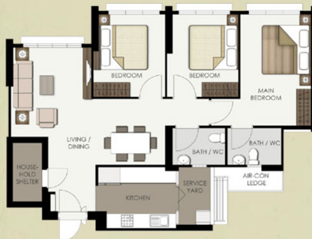
LAYOUT IDEAS FOR 4-ROOM APPROX. FLOOR AREA 93 sqm (Inclusive of Internal Floor Area 90 sqm and Air-Con Ledge)