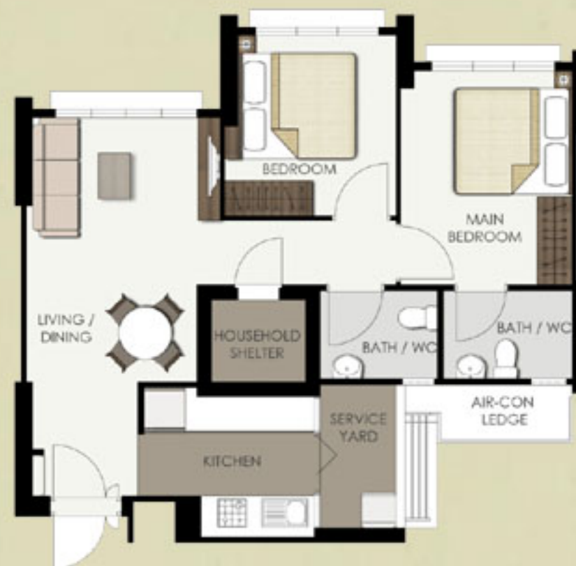
LAYOUT IDEAS FOR 3-ROOM APPROX. FLOOR AREA 68 sqm (Inclusive of Internal Floor Area 65 sqm and Air-Con Ledge)