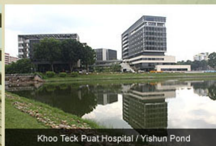
Khoo Teck Puat Hospital / Yishun Pond