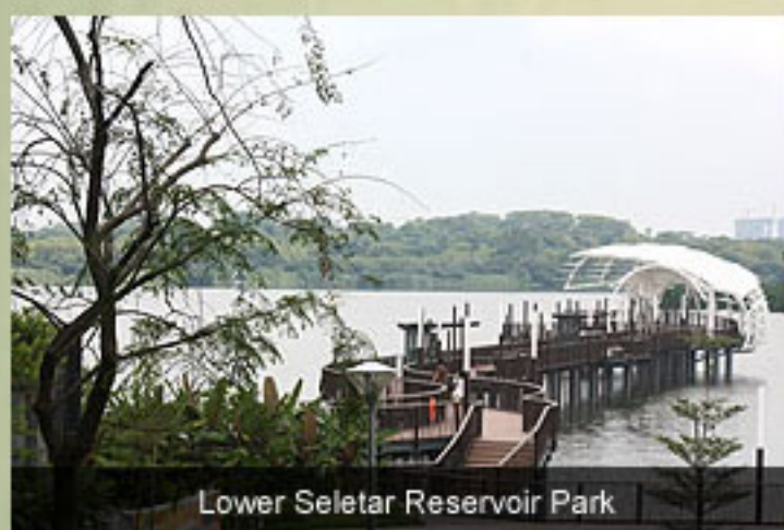
Lower Seletar Reservoir Park