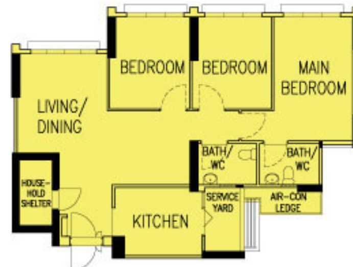
TYPICAL 4-ROOM FLOOR PLAN

(Inclusive of Internal Floor Area 65 sqm and Air-Con Ledge)