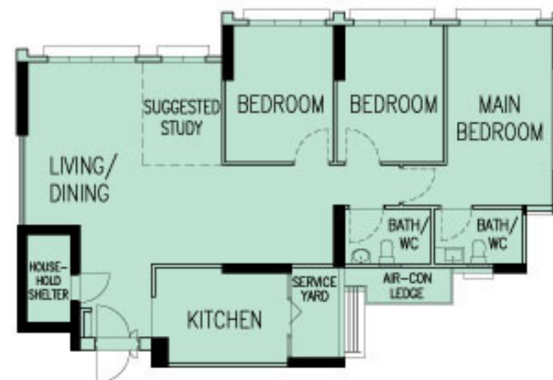
TYPICAL 5-ROOM FLOOR PLAN

(Inclusive of Internal Floor Area 90 sqm and Air-Con Ledge)