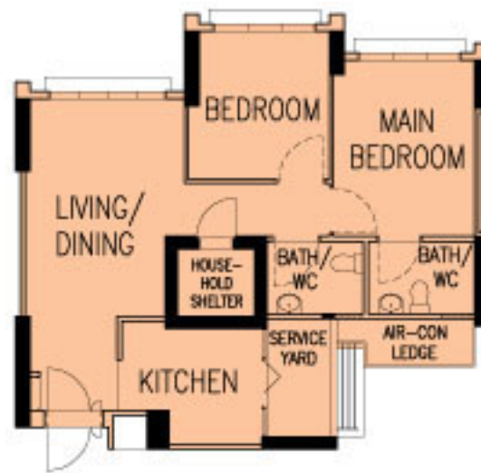
TYPICAL 3-ROOM FLOOR PLAN