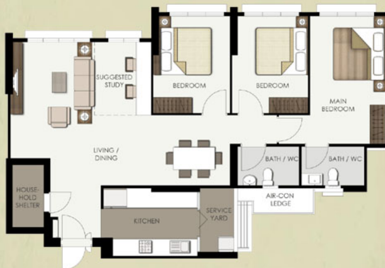
LAYOUT IDEAS FOR 5-ROOM APPROX. FLOOR AREA 113 sqm (Inclusive of Internal Floor Area 110 sqm and Air-Con Ledge)