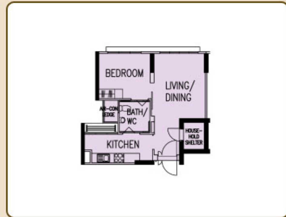
TYPICAL STUDIO APARTMENT (TYPE B) FLOOR PLAN APPROX. FLOOR AREA 46 sqm (Inclusive of Internal Floor Area 45 sqm and Air-Con Ledge)