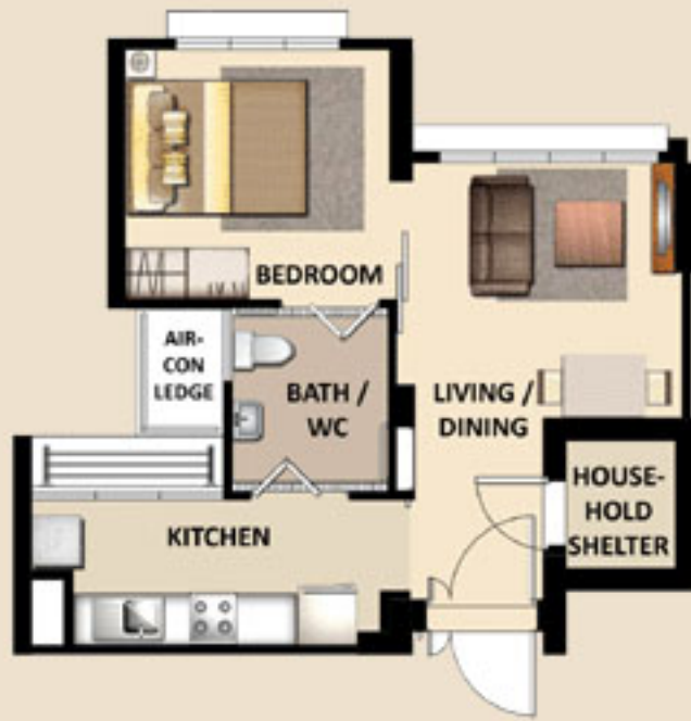
TYPICAL STUDIO APARTMENT (TYPE A) FLOOR PLAN APPROX. FLOOR AREA 36 sqm (Inclusive of Internal Floor Area 35 sqm and Air-Con Ledge)