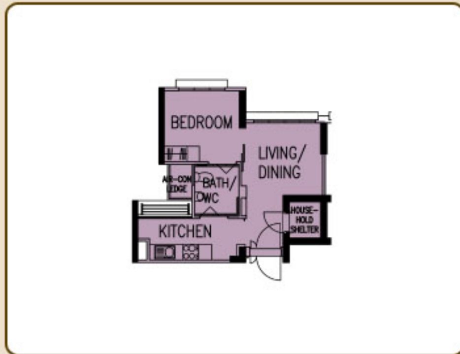
TYPICAL STUDIO APARTMENT (TYPE A) FLOOR PLAN APPROX. FLOOR AREA 36 sqm (Inclusive of Internal Floor Area 35 sqm and Air-Con Ledge)