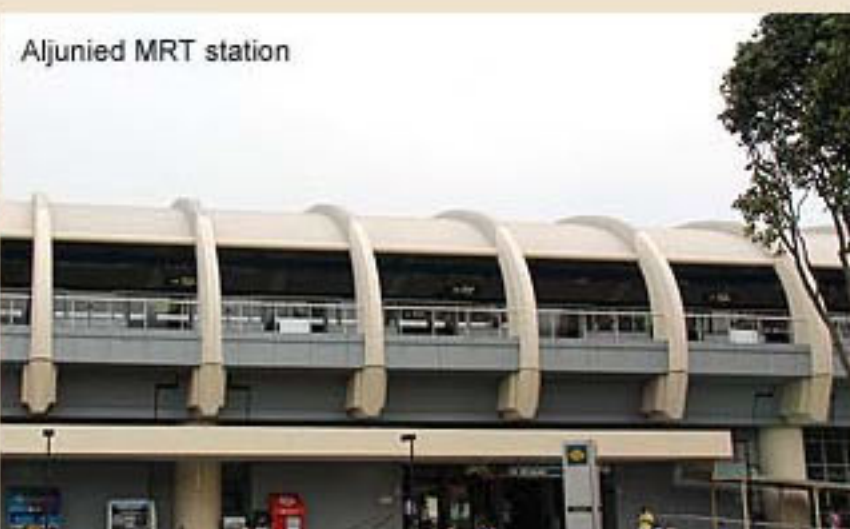
Aljunied MRT station