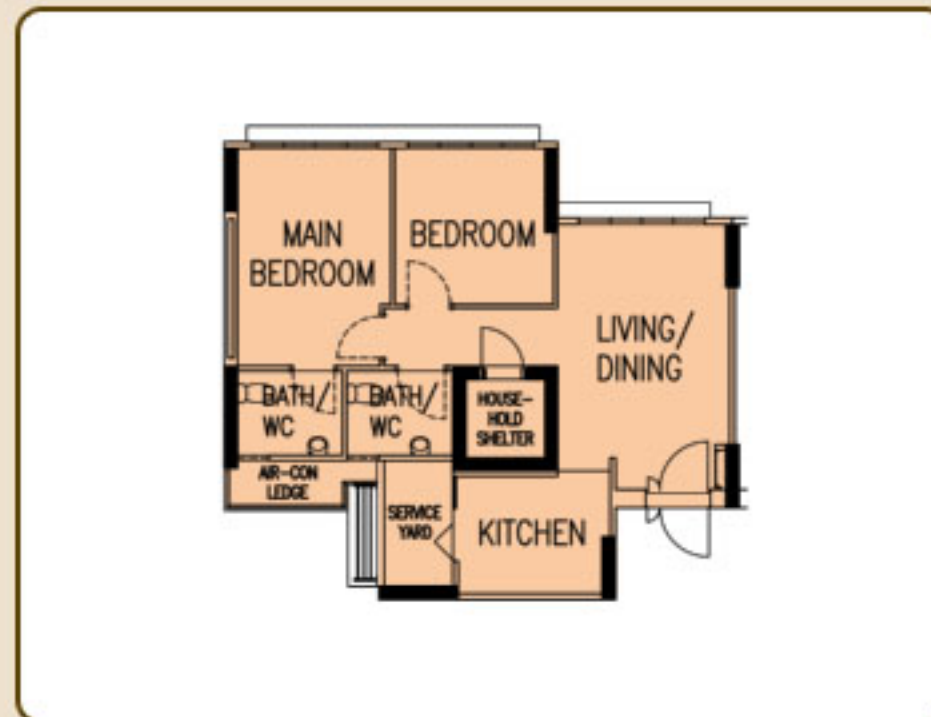
TYPICAL 3-ROOM FLOOR PLAN APPROX. FLOOR AREA 68 sqm (Inclusive of Internal Floor Area 65 sqm and Air-Con Ledge)

The coloured floor plans are not intended to demarcate the boundary of the flat.