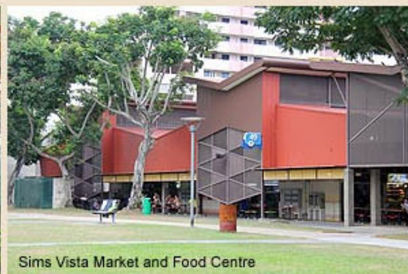
Sims Vista Market and Food Centre