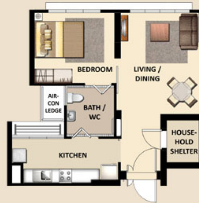
TYPICAL STUDIO APARTMENT (TYPE B) FLOOR PLAN APPROX. FLOOR AREA 46 sqm (Inclusive of Internal Floor Area 45 sqm and Air-Con Ledge)