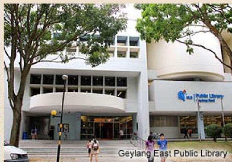
Geylang East Public Library