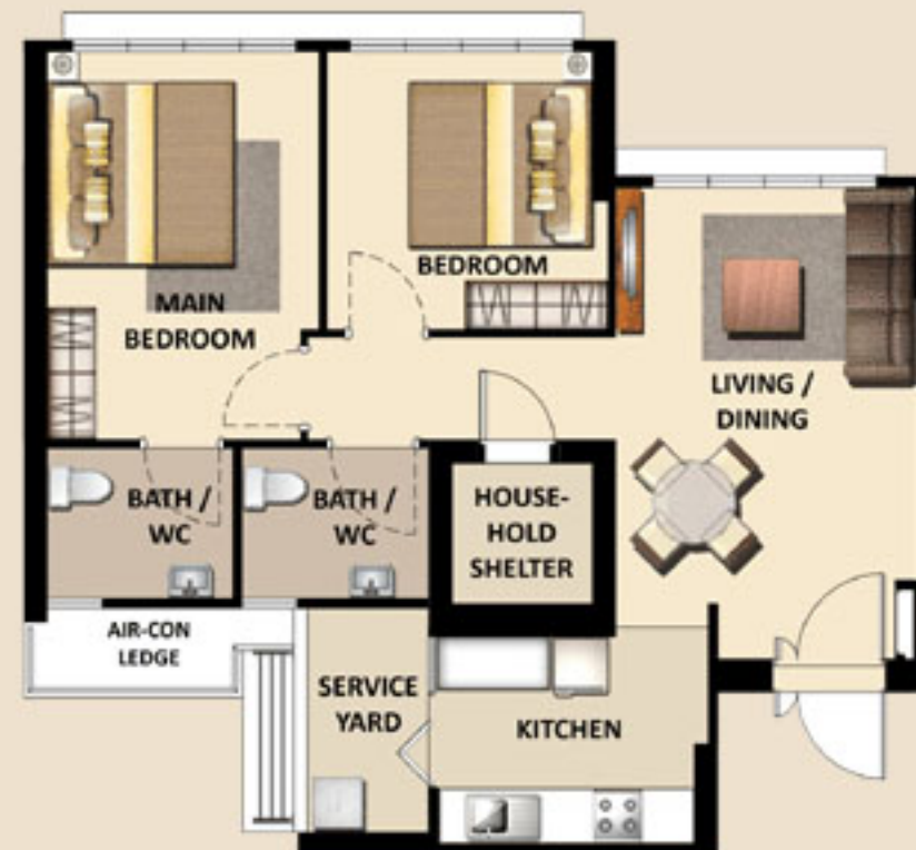
TYPICAL 3-ROOM FLOOR PLAN APPROX. FLOOR AREA 68 sqm (Inclusive of Internal Floor Area 65 sqm and Air-Con Ledge)