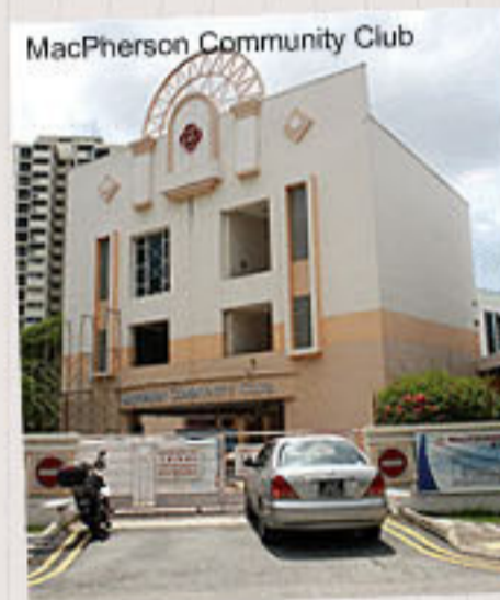
MacPherson Community Club

Residents who wish to pursue hobbies and make new friends can participate in the activities held at MacPherson Community Club. For the more active, Geylang East Swimming Complex and Geylang Sports and Recreation Centre offer ideal venues for sports and games. Jogging enthusiasts can head to the nearby Balam Park Connector or choose a more challenging 3km run along Geylang Park Connector.