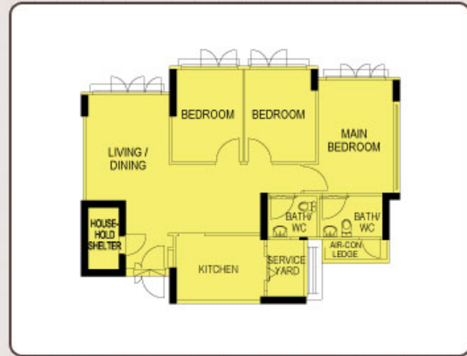
TYPICAL 4-ROOM FLOOR PLAN APPROX. FLOOR AREA 93 sqm (Inclusive of Internal Floor Area 90 sqm and Air-Con Ledge)

The coloured floor plans are not intended to demarcate the boundary of the flat.