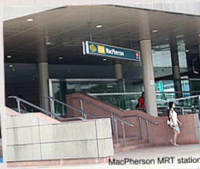
MacPherson MRT station

Enjoy convenient access to public transport as MacPherson MRT station is just a short walk away. Commuting will be further enhanced when this station links up with the upcoming Downtown Line 3. Furthermore, the development is only a few minutes' drive from the Kallang-Paya Lebar Expressway (KPE) and Pan-Island Expressway (PIE).