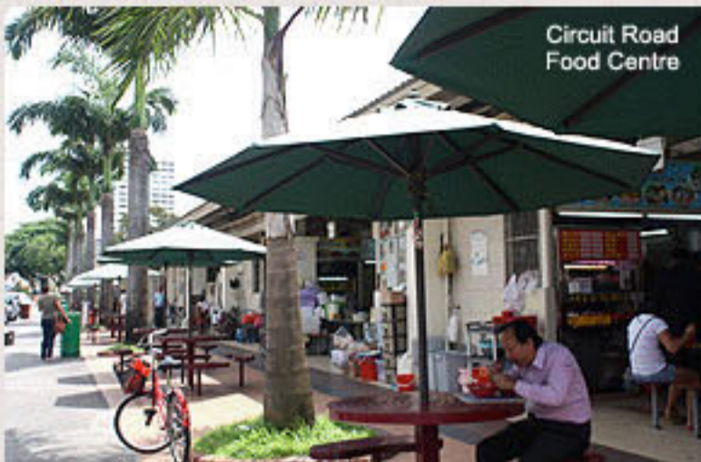
Circuit Road Food Centre