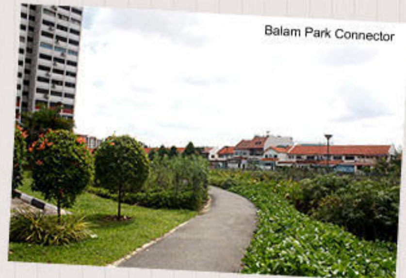
Balam Park Connector