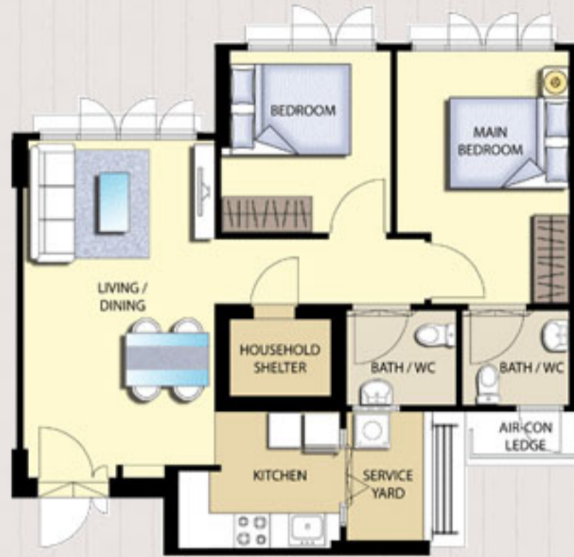
TYPICAL 3-ROOM FLOOR PLAN APPROX. FLOOR AREA 67 sqm (Inclusive of Internal Floor Area 65 sqm and Air-Con Ledge)