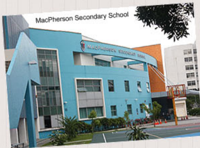
MacPherson Secondary School