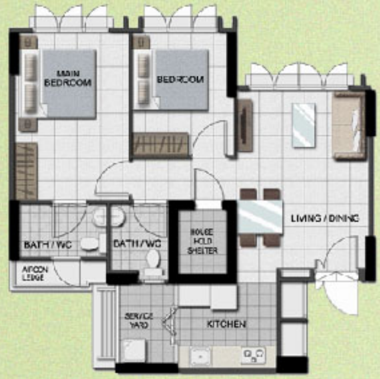
TYPICAL 3-ROOM FLOOR PLAN APPROX. FLOOR AREA 67 sqm (Inclusive of Internal Floor Area 65 sqm and Air-Con Ledge)