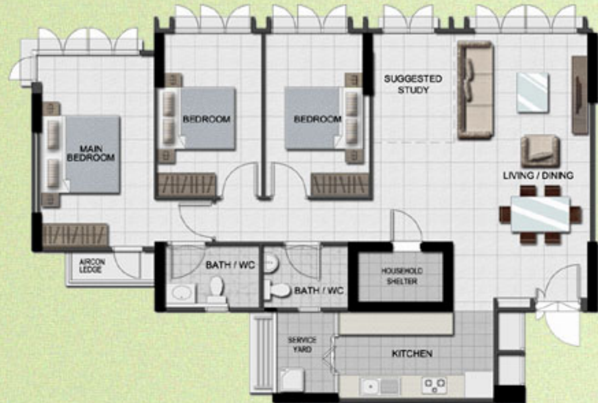
TYPICAL 5-ROOM FLOOR PLAN APPROX. FLOOR AREA 112 sqm (Inclusive of Internal Floor Area 110 sqm and Air-Con Ledge)