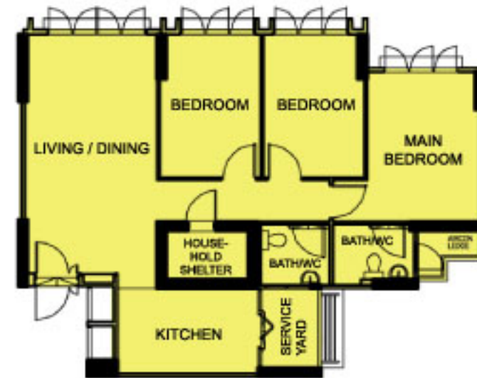
TYPICAL 4-ROOM FLOOR PLAN APPROX. FLOOR AREA 92 sqm

(Inclusive of Internal Floor Area 65 sqm and Air-Con Ledge)