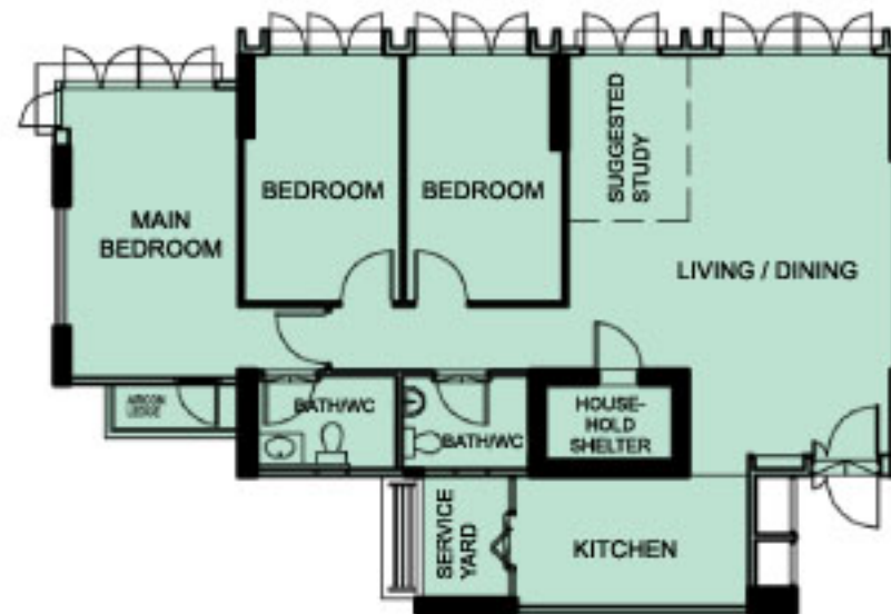
TYPICAL 5-ROOM FLOOR PLAN

(Inclusive of Internal Floor Area 90 sqm and Air-Con Ledge)