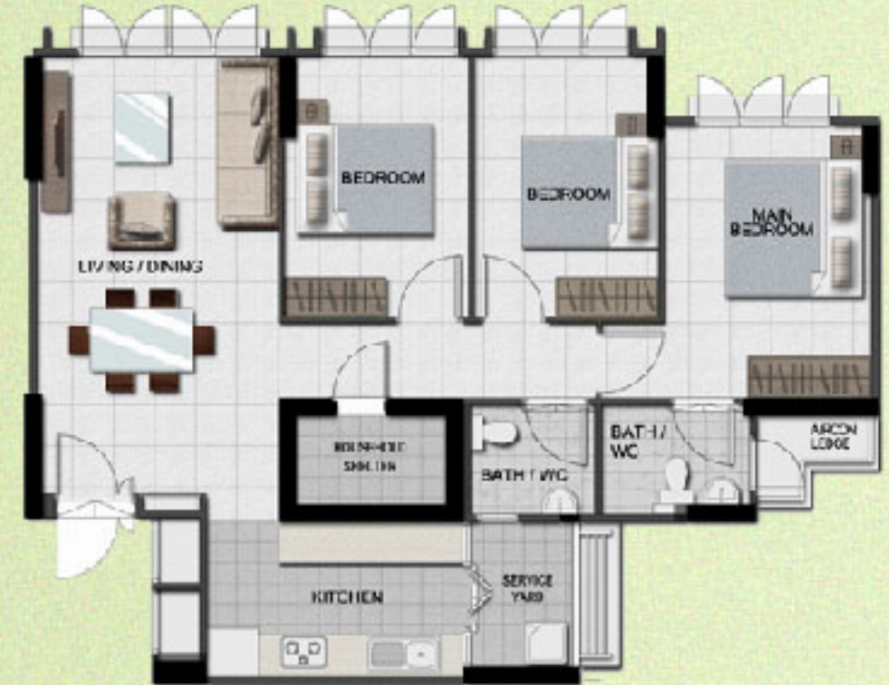
TYPICAL 4-ROOM FLOOR PLAN APPROX. FLOOR AREA 92 sqm (Inclusive of Internal Floor Area 90 sqm and Air-Con Ledge)