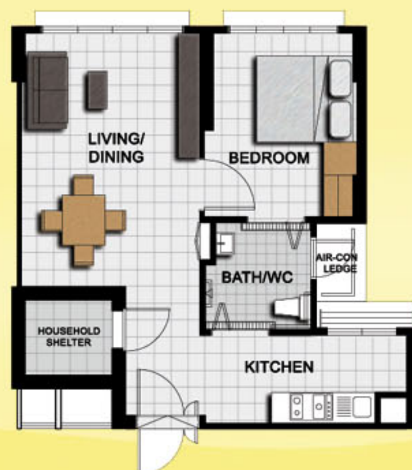
TYPICAL STUDIO APARTMENT (TYPE B) FLOOR PLAN APPROX. FLOOR AREA 47 sqm (Inclusive of Internal Floor Area 45 sqm and Air-Con Ledge)