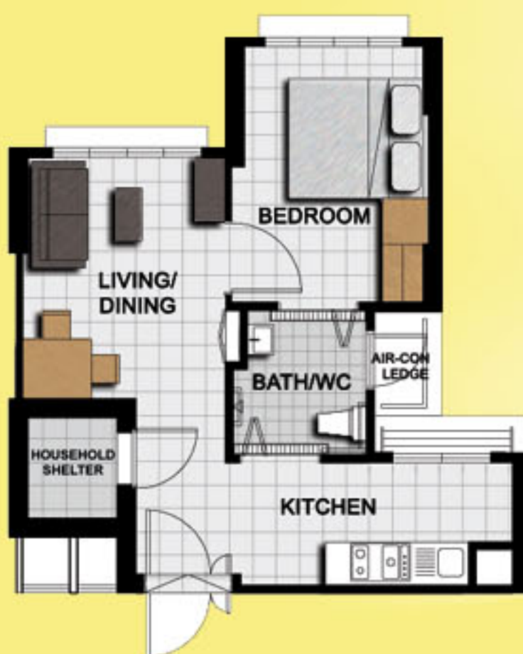
TYPICAL STUDIO APARTMENT (TYPE A) FLOOR PLAN APPROX. FLOOR AREA 37 sqm (Inclusive of Internal Floor Area 35 sqm and Air-Con Ledge)