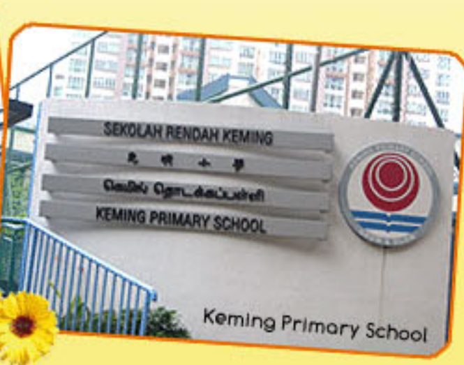
Keming Primary School