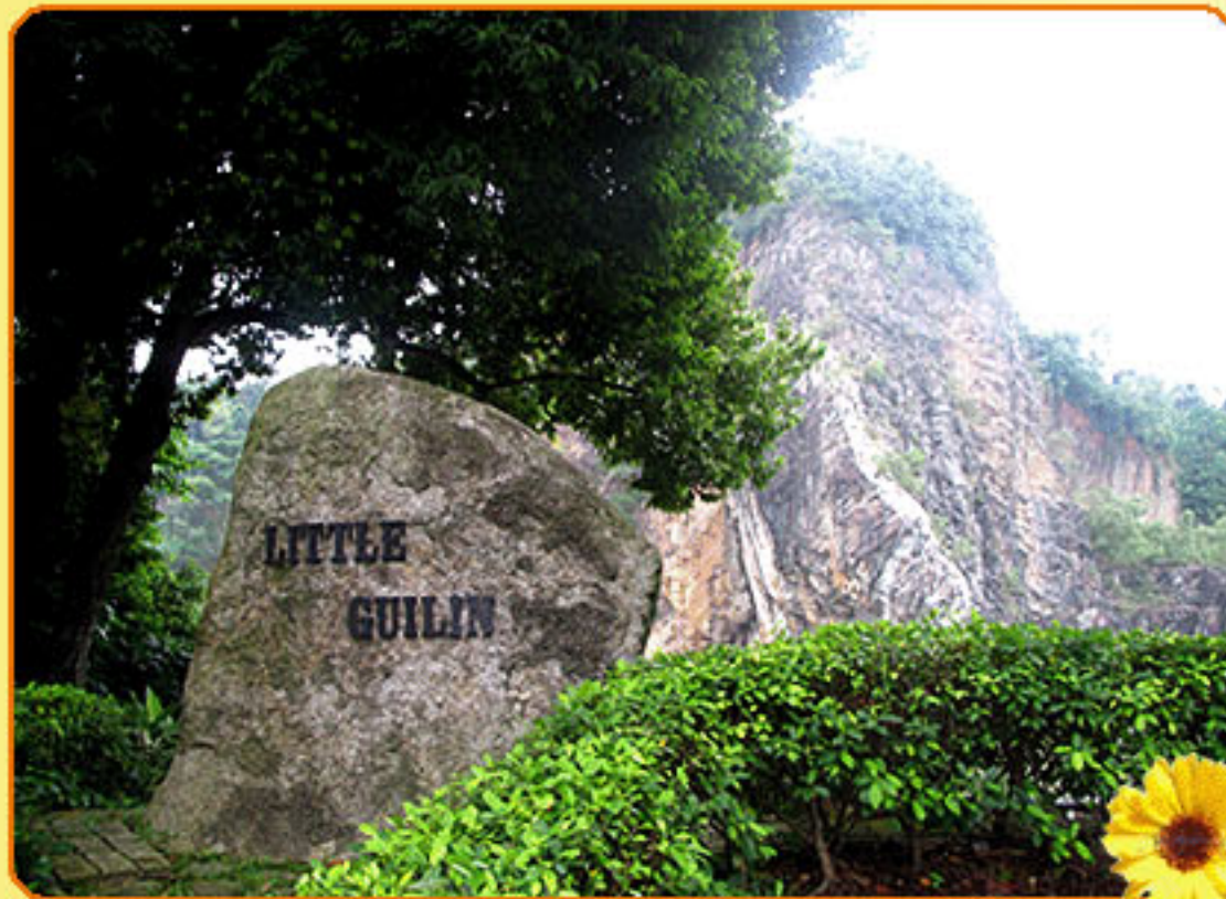
Bukit Batok Town Park (Little Guilin)