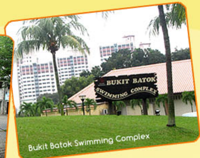
Bukit Batok Swimming Complex

Residents can look forward to effortless commuting to the rest of the island with the PIE located just minutes away. The Bukit Batok MRT Station and bus interchange are also conveniently located within the town centre.