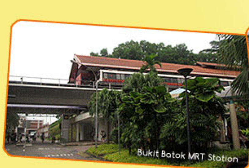
Bukit Batok MRT Station

There are several schools found near the development like Keming Primary School, Bukit View Primary and Bukit View Secondary School.