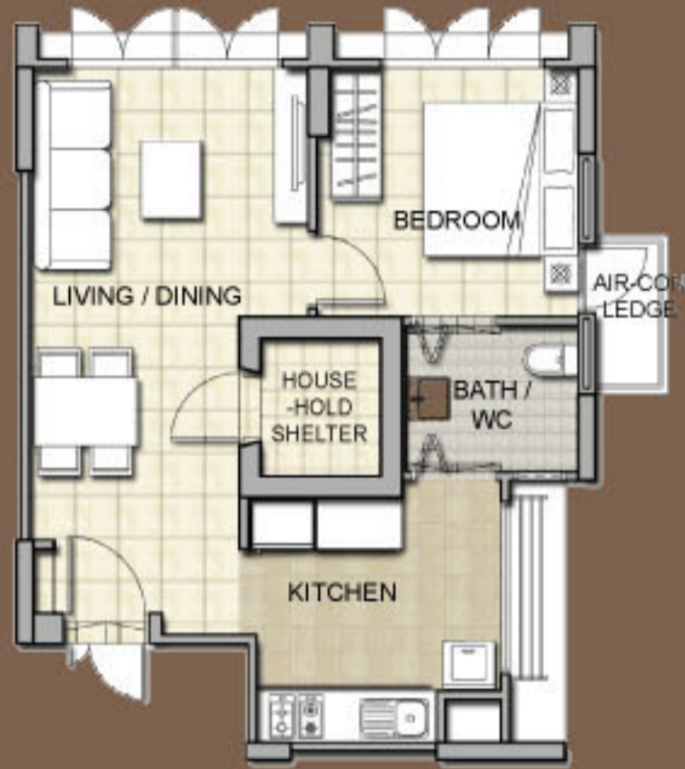
TYPICAL 2-ROOM FLOOR PLAN APPROX. FLOOR AREA 47 sqm (Inclusive of Internal Floor Area 45 sqm and Air-Con Ledge)