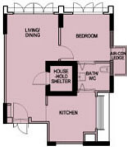
TYPICAL 2-ROOM FLOOR PLAN APPROX. FLOOR AREA 47 sqm (Inclusive of Internal Floor Area 45 sqm and Air-Con Ledge)