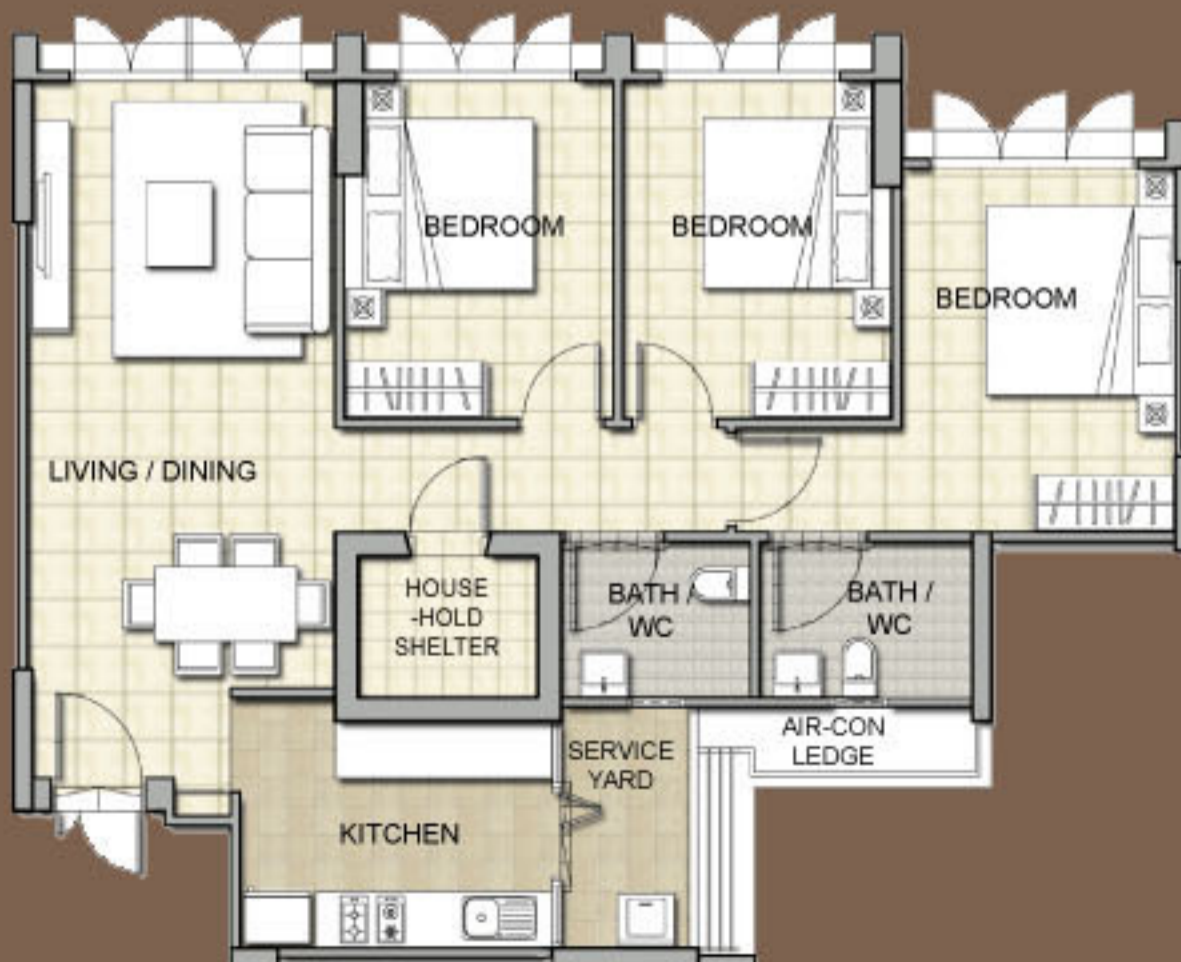
TYPICAL 4-ROOM FLOOR PLAN APPROX. FLOOR AREA 93 sqm (Inclusive of Internal Floor Area 90 sqm and Air-Con Ledge)