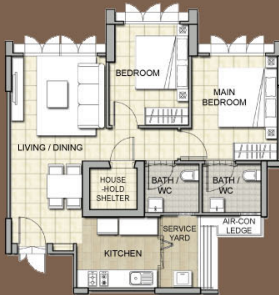
TYPICAL 3-ROOM FLOOR PLAN APPROX. FLOOR AREA 67 sqm (Inclusive of Internal Floor Area 65 sqm and Air-Con Ledge)